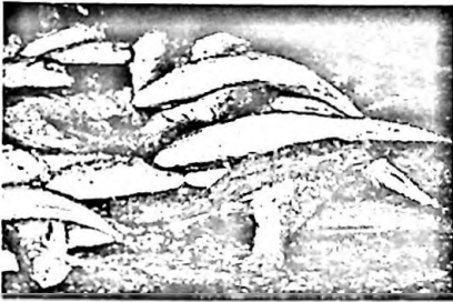
Grouping of four or five (depending on size)

It is possible to draw on the social and cultural contexts of students to teach many of the topics that have been identified as being difficult for students at the basic school level such as division. In teaching division, for example, societal practices involving the sale of vegetables such as tomatoes which involves grouping (see Figure 2) could be employed to teach the topic meaningfully. The sale of fishes also involve grouping. Practices involving measurement of vegetables and fishes by grouping support development of the concept of division in school. In teaching x divided by four, for example, the sale of garden eggs or tomatoes could form a context which will results in repeated subtraction of four or multiples of four till x items of the garden eggs are exhausted. Often these ideas are taught out of context, for example, repeatedly subtracting a number of pebbles, counting sticks and so on, which do not often help pupils to connect mathematics and everyday mathematical activities within their society or culture.