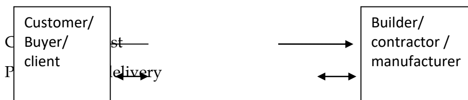
Fig. 1. Direct Agreement between the Client and Contractor

Figure 1, above shows the customer requesting the contractor to carry out the project for him. Both of them conclude on istisna' price which is the cost price plus the profit to be made by the contractor. The agreement is sealed, the contractor completes the project and delivers it to the customer directly while the customers pays the contractor directly too and at the expiration of the payment based on agreed istisna' terms, the contract ends.